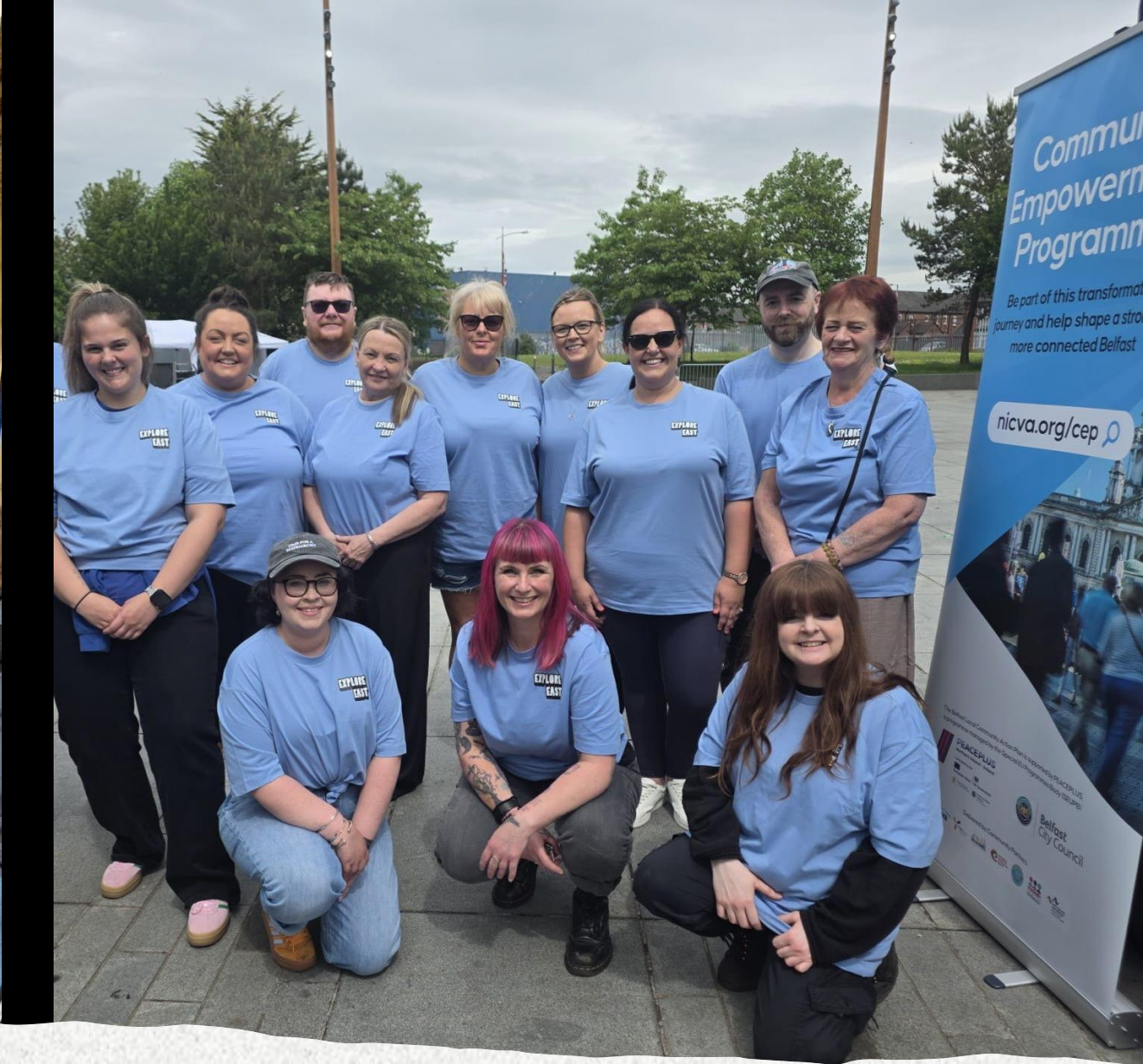
Social Action Project – Explore East 30 May 2026